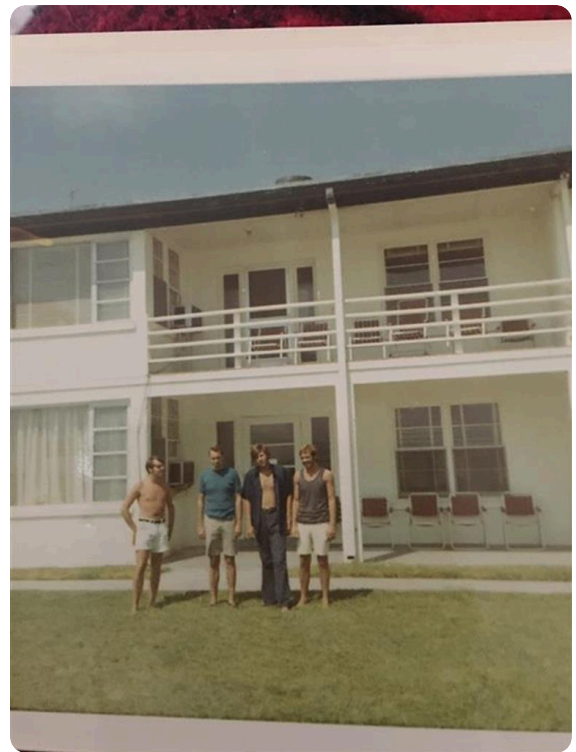
Spring Break 1968