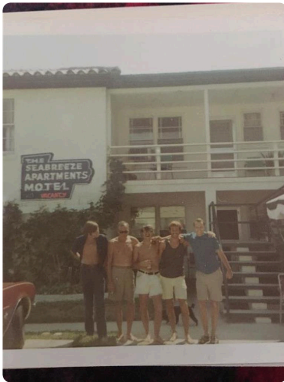
Spring Break 1968